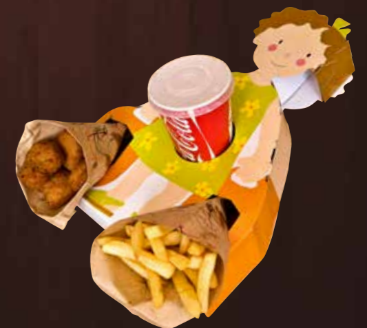
DAISY DOLL 6,50 Chicken nuggets, chips and drink