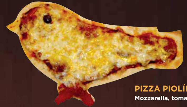
PIZZA PIOLÍN 4,90 Mozzarella, tomato and oregano