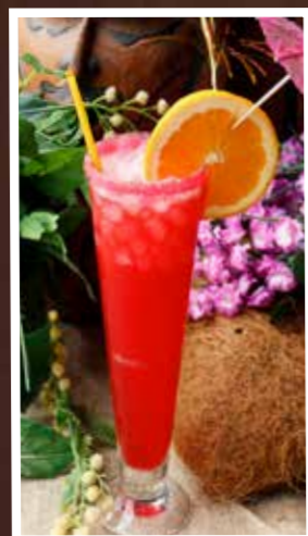
CARIBE DREAMS 4,25 LIME, GRENADINE AND PINEAPPLE JUICE