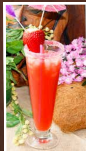
SAN FRANCISCO 4,25 PINEAPPLE JUICE, ORANGE JUICE, PEACH JUICE AND GRENADINE