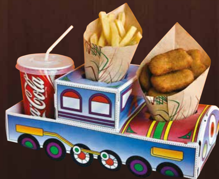
THOMAS THE TANK ENGINE 6,50 Chicken nuggets, chips and drink