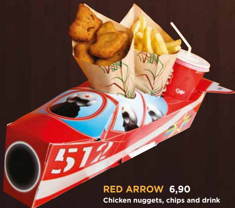
RED ARROW 6,90 Chicken nuggets, chips and drink