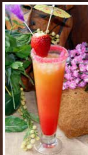
SAXO 4,25 PASSION FRUIT, ORANGE JUICE AND GRENADINE