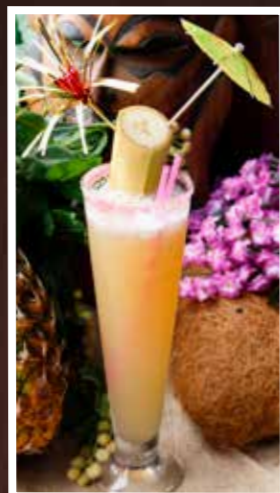
OLIMPO 4,25 PASSION FRUIT, PINEAPPLE AND LIME JUICE