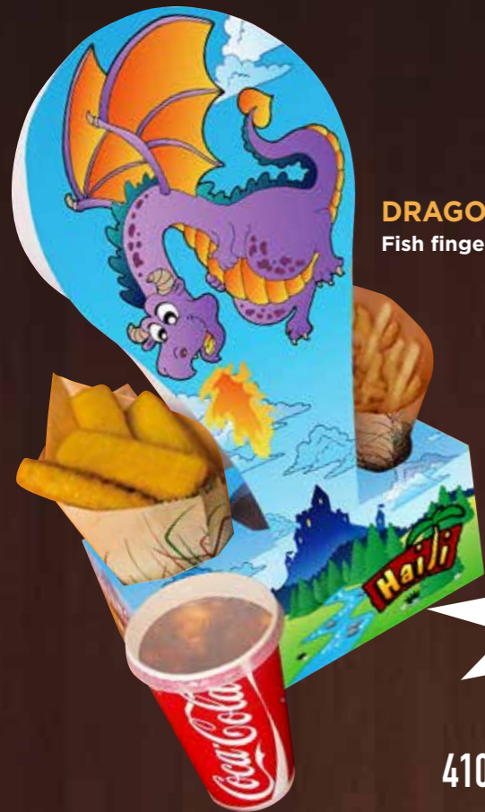
DRAGON LUCAS 6,50 Fish fingers, chips and drink